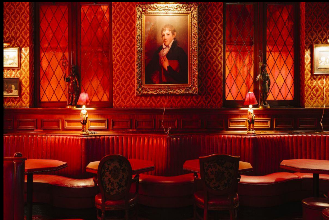
The Prince 3198 1/2 W 7th Street